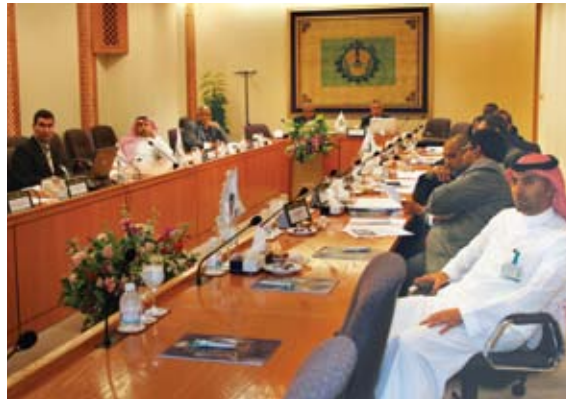
Meeting of the Consultative Committee Members, March 2009

ICIIEC's Consultative Committee held its first meeting for 1430H on March 25th, 2009. The agenda of the meeting included a review of the Annual Report and audited financial statements of the corporation for 1429H. The committee members also followed-up on various matters arising out of the previous meeting including reform of ICIIEC's corporate governance ♦