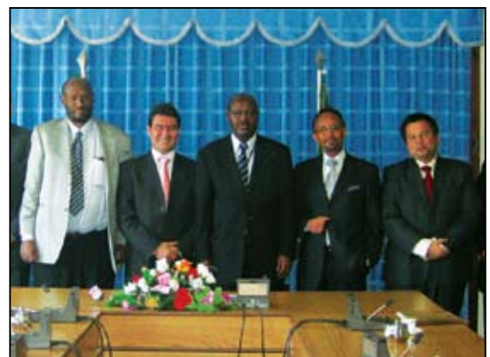
Ethiopian Minister of Finance with ICIIEC delegation,

The delegation met with the Honorable Minister of Finance of Ethiopia, Mr. Sufian Ahmed, and the Honorable Cabinet Affairs Minister, Mr. Berhanu Adello. Members of the delegation briefed the Honorable Ministers on ICIIEC and its services, and discussed various areas of mutual cooperation ♦