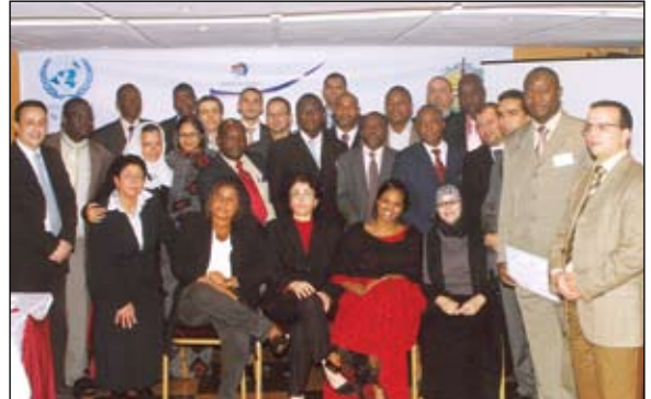
Participants in the training program, March 2009