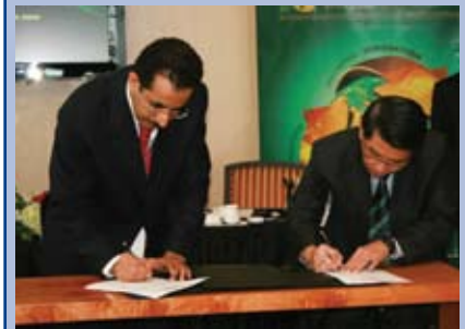
CEO & GM of ICD and CEO of Mandala Finance sign the agreement

On the sidelines of the 5 th WIEF event, the Islamic Corporation for the Development of the Private Sector (ICD) hosted an Indonesia Dialogue which was opened by IDB Group President.