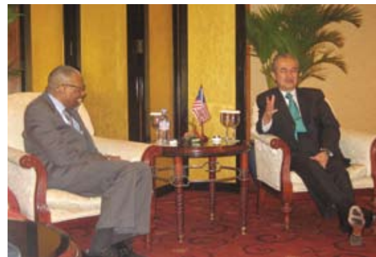
IDB Group President with Prime Minister of Malaysia

The success of the event can be judged from the fact that