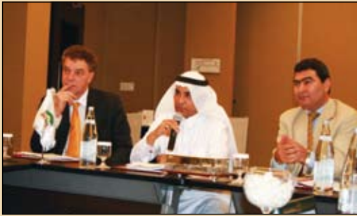
ICIEC's Director of HRM & Corporate Services gives a brief on the training program

A s a part of its Staff professional development programs, ICIEC organized a general training course on Export Credit and Investment Insurance and Relevant BIS Regulations.