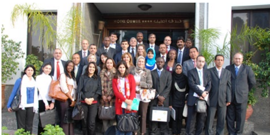
Photo of Participants in the Program, 8 December 2011, Rabat, Morocco

The three-day program brought together 36 investment officials representing 30 Member Countries, and aimed to inform participants of best practices on FDI and Entrepreneurship Development and exchange ideas among IDB Member Countries on best practices in the area.