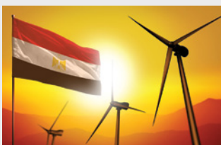
How can credit and political risk insurance help facilitate climate action?