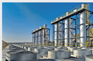
ICIEC supports energy investments in Uzbekistan