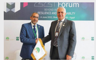
ICIEC and FAIR agree on new cooperation on trade and investment