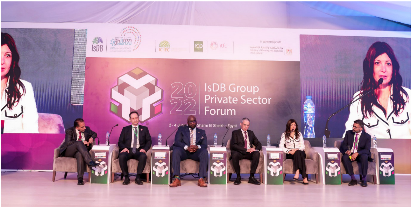
This is a digest of a high-level panel convened by ICIEC on June 2, 2022, at the IsDB Group's Private Sector Forum, which ran at the IsDB's 47th Annual Meetings in Sharm El-Sheikh, Egypt. The panel had representatives from The Central Bank of Egypt, Afreximbank, Egypt Post, AlFaris International Group, Azentio Software, and DinarStandard.

The Central Bank of Egypt has a similar initiative – Regulatory Sandbox – to support technology start-ups navigating regulatory frameworks. The Regulatory Sandbox works as a live testing ground for Fintechs, developing new business models currently hindered by stringent authorization requirements and regulatory uncertainty. The Regulatory Sandbox aims to pave the way for faster and easier access to new financial solutions and embed compliance within the Fintech ecosystem at an early stage.